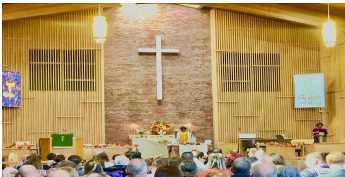
UMC Commonwealth East District News

If you would like to host coffee hour, there is a sign-up sheet located in the back of the Sanctuary or you can email the Office. Thank you!