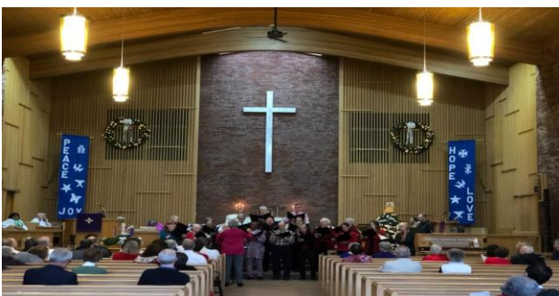
Pictures of the UMC Clergy and Choirs were taken at the "Advent Festival of Faithful Voices" HUB Event, held at Fisk UMC on December 2, 2023.