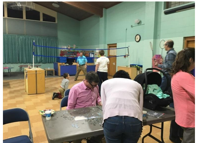
Friendly competition, April 6, 2018