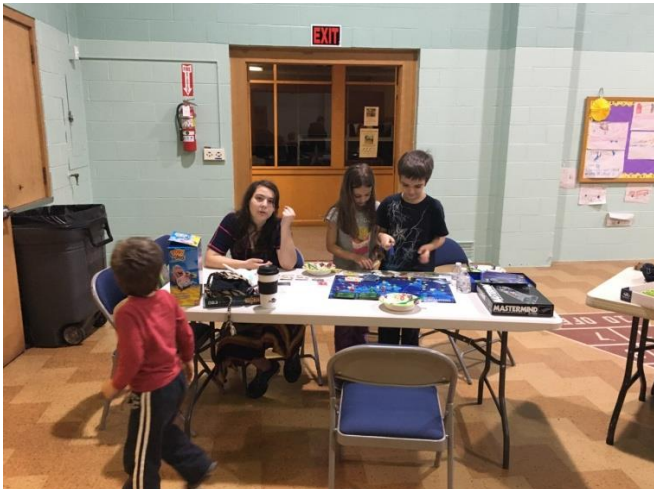
Getting creative, April 6, 2018

We held another event on Friday, April 6 for our youth and families and it seems that each event is better than the last. Hence, if you would like to send your youth to spend quality time, meet other youth, and have fun, you are welcome to; a place that has interest in the outcome of their lives and create lasting connections. In this view, all youth are invited to join us on the first Friday of each month from 6:30-8:30, come, bring a game or something to share and create lasting memory.