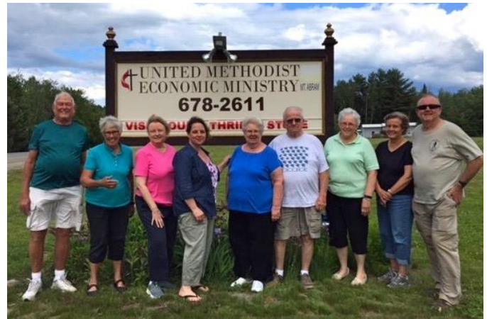
Mission Team 2017