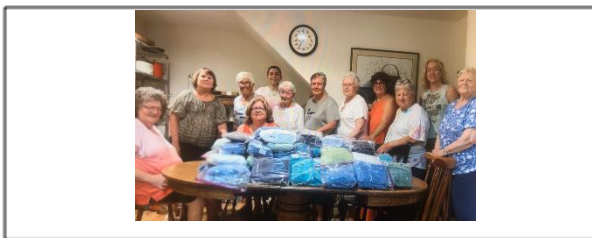
Women's Retreat at Hoyt's in August