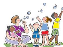
Summer Child Care

Children from birth to finishing Grade One ONLY will be welcome to join the group in the nursery and early childhood room. There will be activities each week and playtime for the youngest. We ask for donations of goldfish and water or juice boxes from those families attending. We look forward to an enriching time for our youngest which will allow for parents and older siblings to worship.